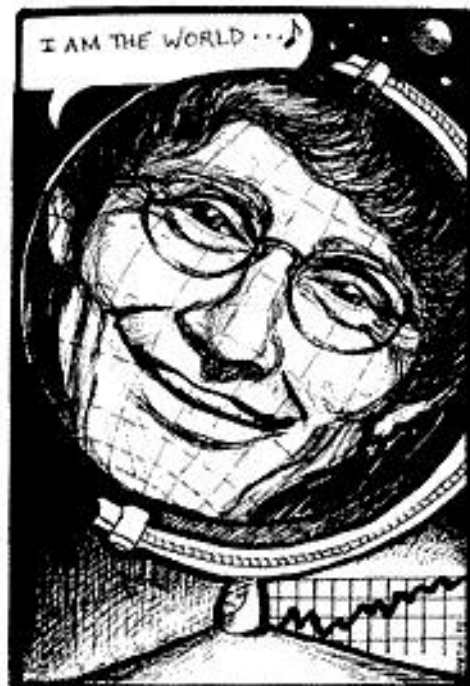
Illustration: M Garcia/Corporate Watch (USA) www.artmecca.com/artspan/mgarcia.htm