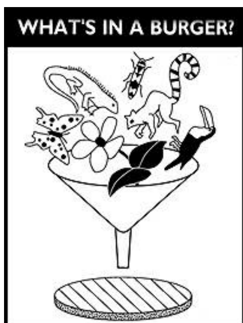
illustration: Corporate Watch (USA)