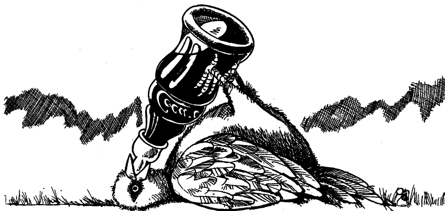
illustration: Habib Haddad (Lebanon)