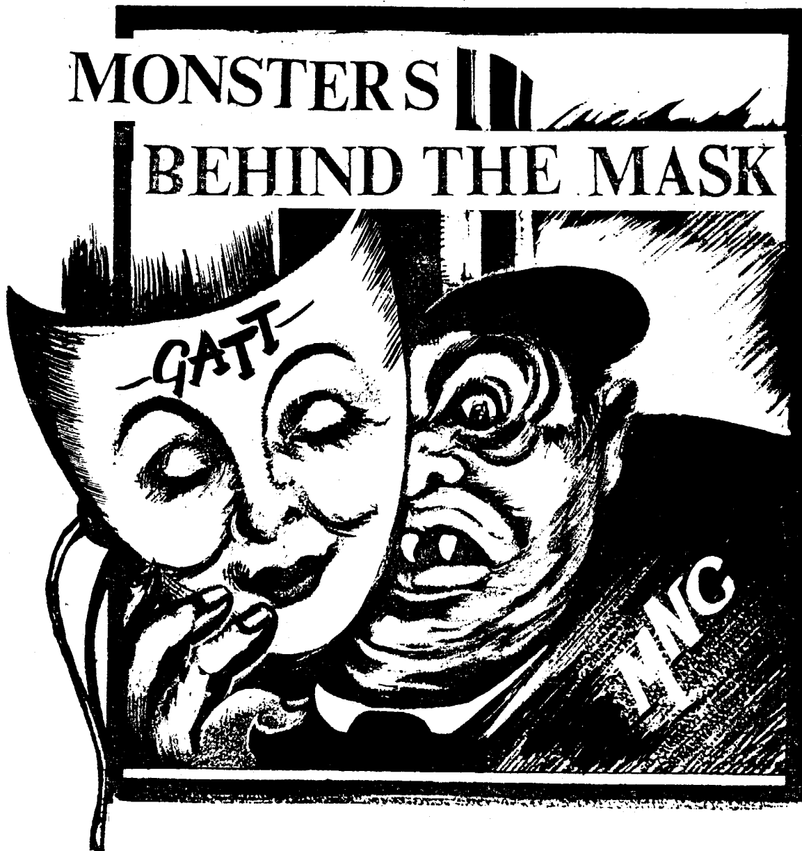
Illustration: Public Interest Research Group (India)