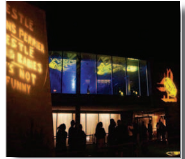
Campaigners projected a message through the windows of the Perrier Award Ceremony in 2005 so the audience was well aware of the Nestlé controversy. Nestlé ended its sponsorship.