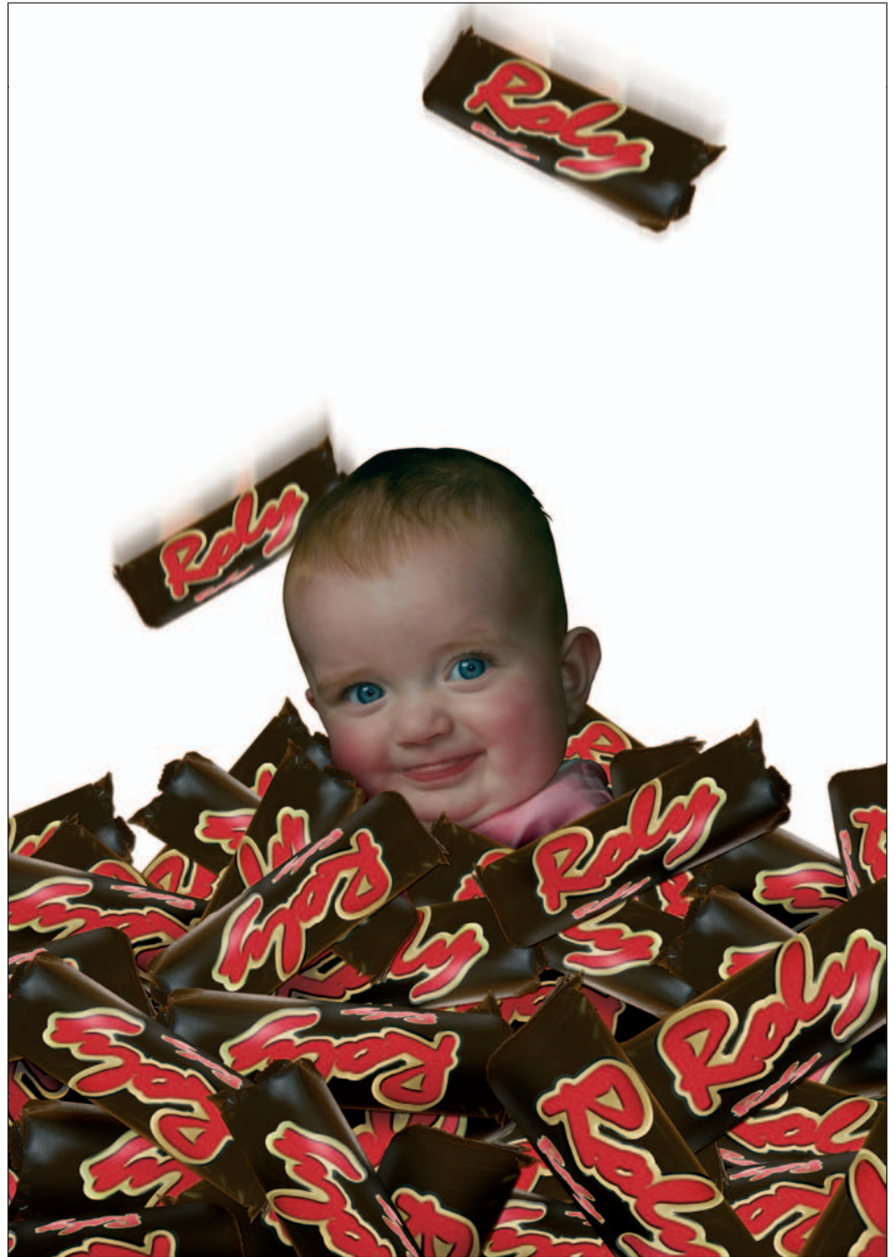
An artificially fed infant consumes 30,000 more calories than a breastfed infant by 8 months - equivalent to 120 chocolate bars. 1